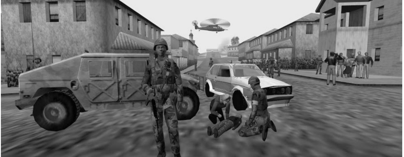
Figure 1: Virtual Bosnian village

perienced a flash of insight in our research that leaves us with intense feelings of joy, only to be crestfallen seconds later by the realization of some crucial flaw. Emotions clearly have a strong influence over our decision-making abilities as well (Damasio 1994; Sloman, 1987).